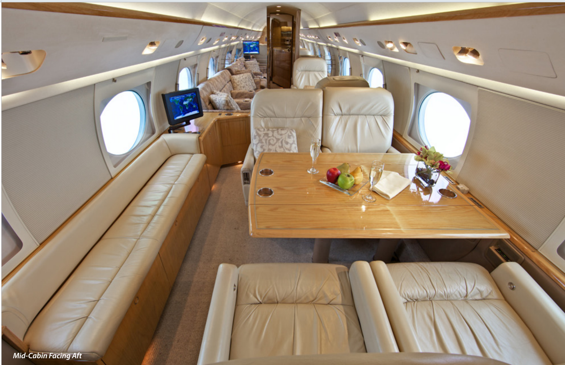
Mid-Cabin Facing Aft

Specifications are subject to verification by purchaser. Aircraft is subject to prior sale, and/or removal from the market without prior notice.