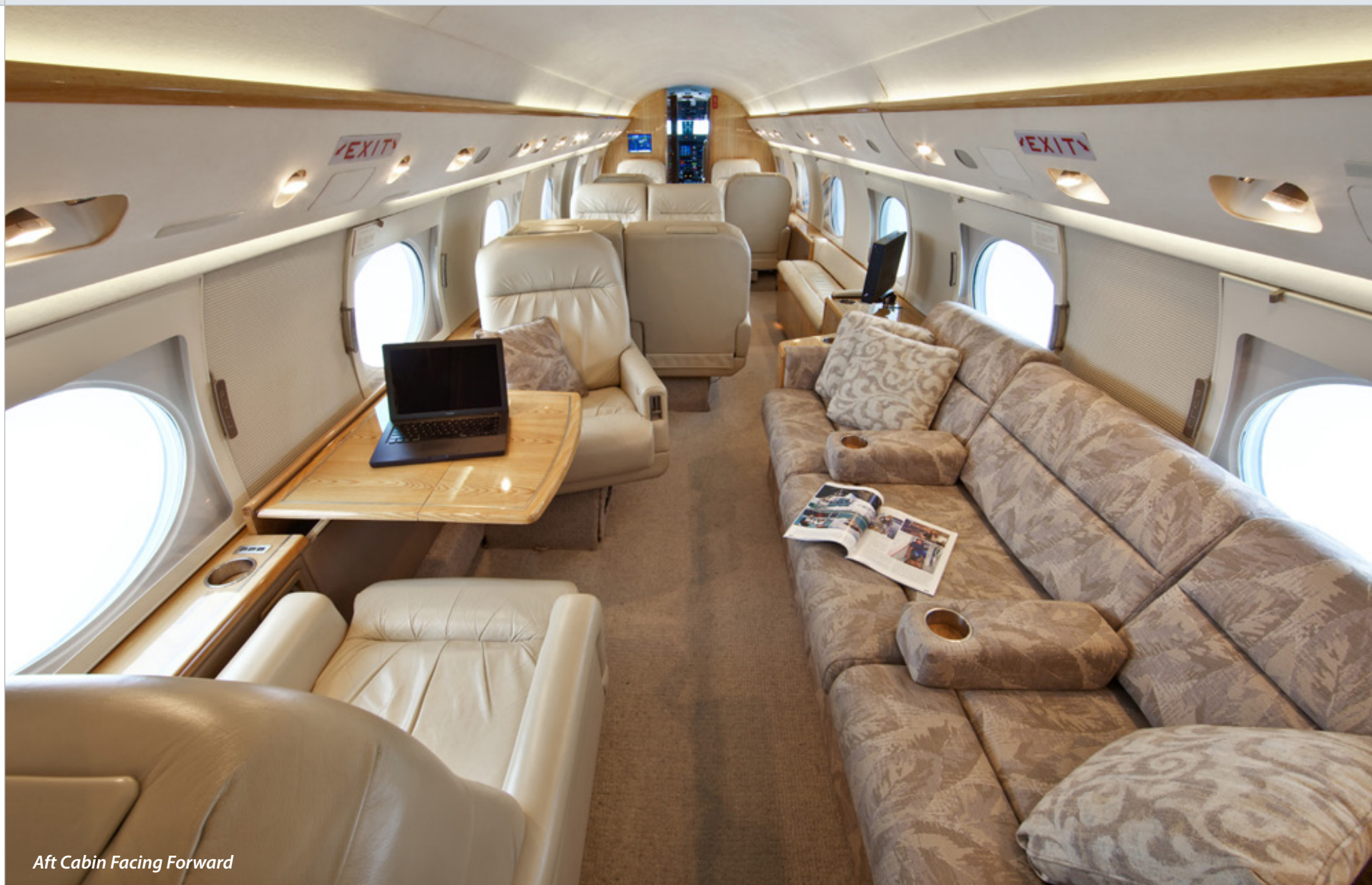
Aft Cabin Facing Forward

Specifications are subject to verification by purchaser. Aircraft is subject to prior sale, and/or removal from the market without prior notice.