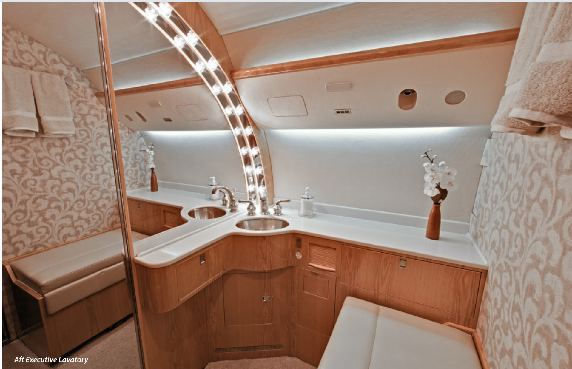
Aft Executive Lavatory

Specifications are subject to verification by purchaser. Aircraft is subject to prior sale, and/or removal from the market without prior notice.