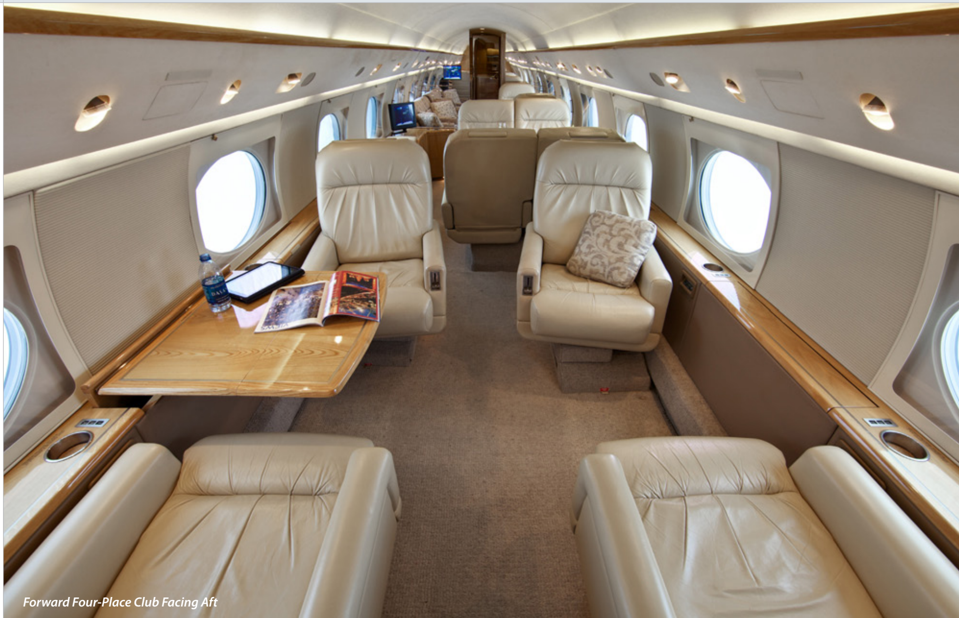
Forward Four-Place Club Facing Aft

Specifications are subject to verification by purchaser. Aircraft is subject to prior sale, and/or removal from the market without prior notice.