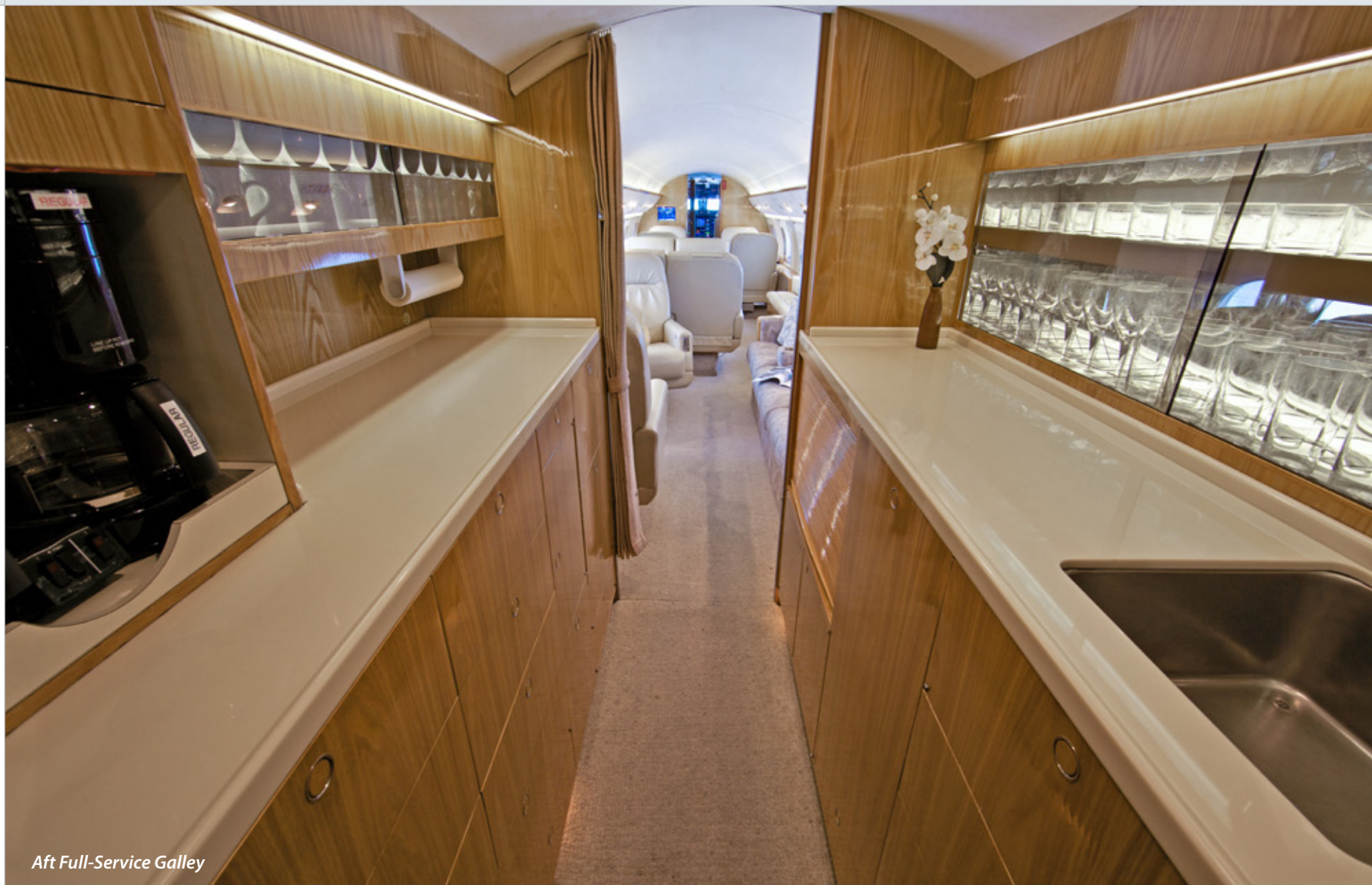
Aft Full-Service Galley

Specifications are subject to verification by purchaser. Aircraft is subject to prior sale, and/or removal from the market without prior notice.