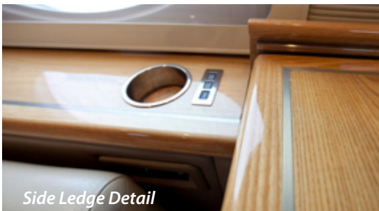
Side Ledge Detail