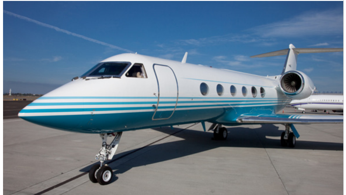
Additional Exterior Views

Specifications are subject to verification by purchaser. Aircraft is subject to prior sale, and/or removal from the market without prior notice.