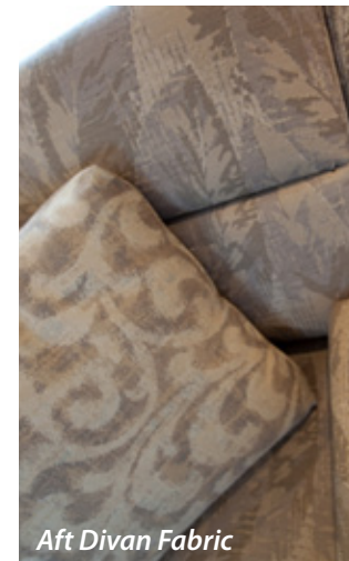
Aft Divan Fabric

Specifications are subject to verification by purchaser. Aircraft is subject to prior sale, and/or removal from the market without prior notice.