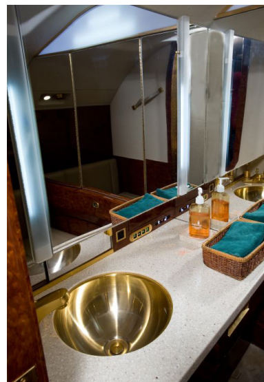
Aft Vanity and Lavatory