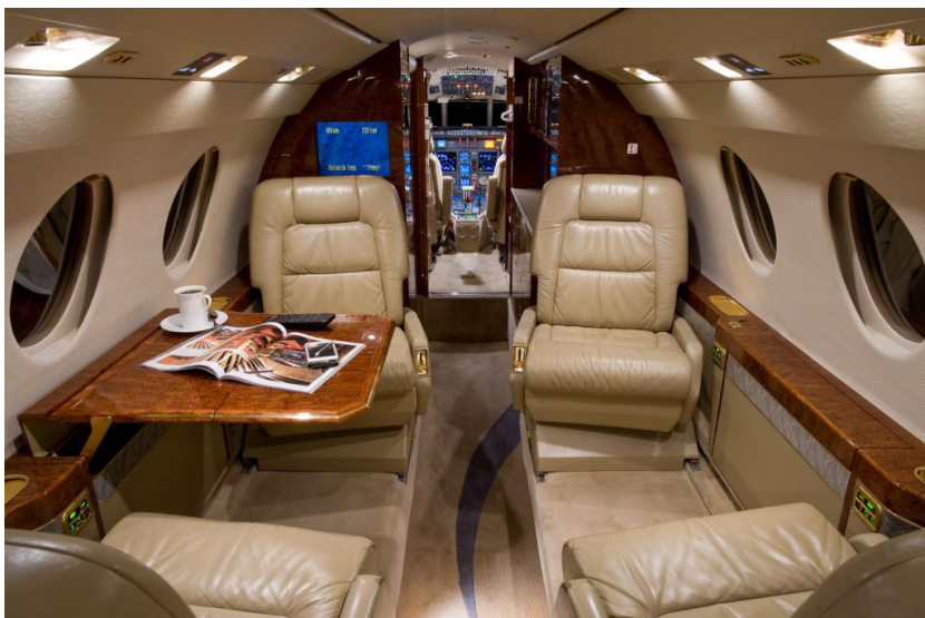
Forward Club Seating Facing Forward