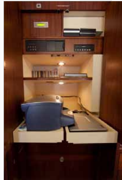
Entertainment and Office Storage

Specifications and/or descriptions are provided as introductory information only and do not constitute representations or warranties. Verification of specifications remain the sole responsibility of purchaser. Aircraft is subject to prior sale, lease, and/or removal from the market without prior notice.