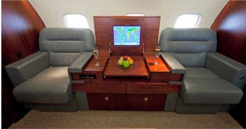
Aft Cabin LCD Center