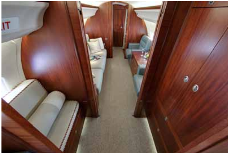
Mid Cabin Bulkhead with Non-Belted Seat and Storage