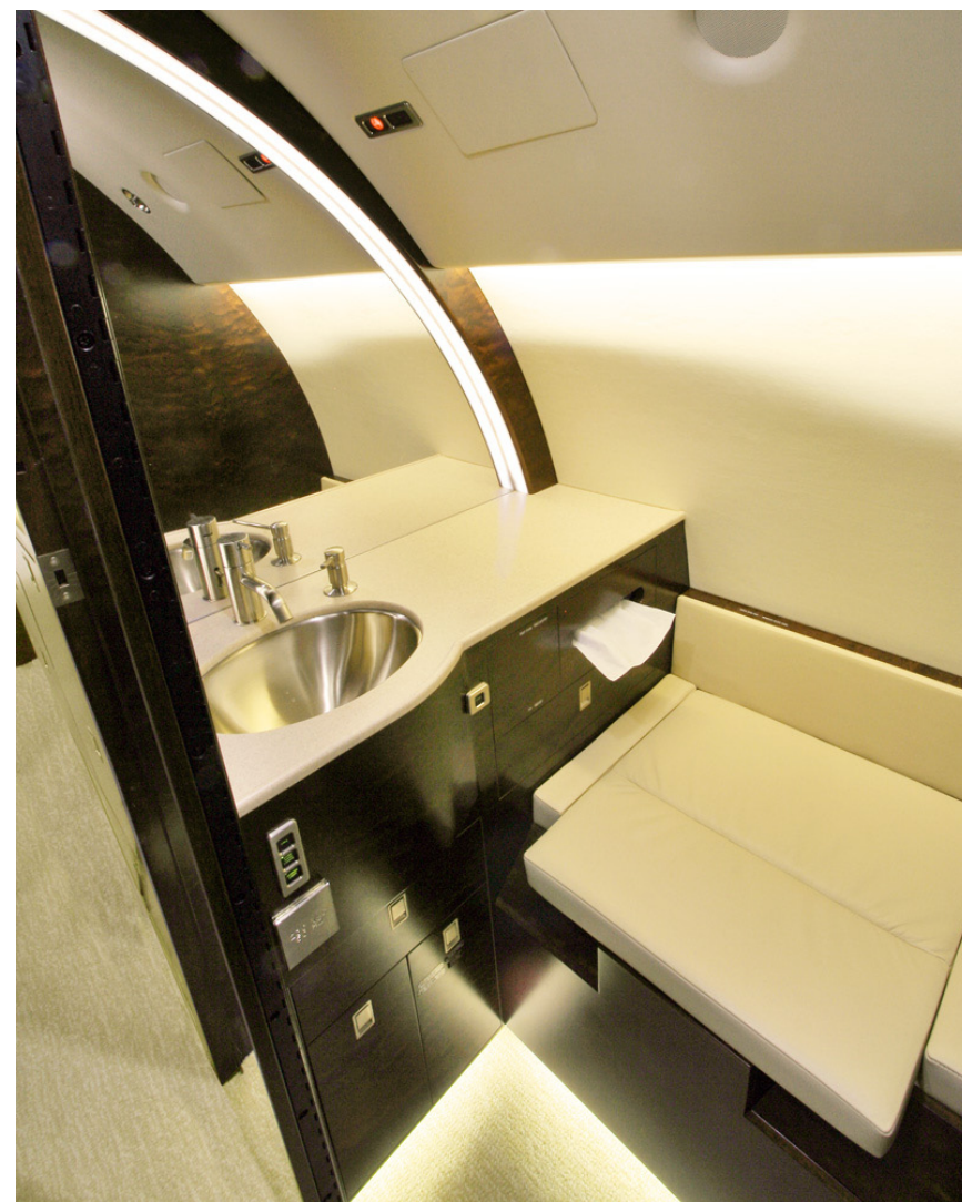
Forward Galley (left) & Forward Lavatory (above)

Specifications are subject to verification by purchaser. Aircraft is subject to prior sale, and/or removal from the market without prior notice.