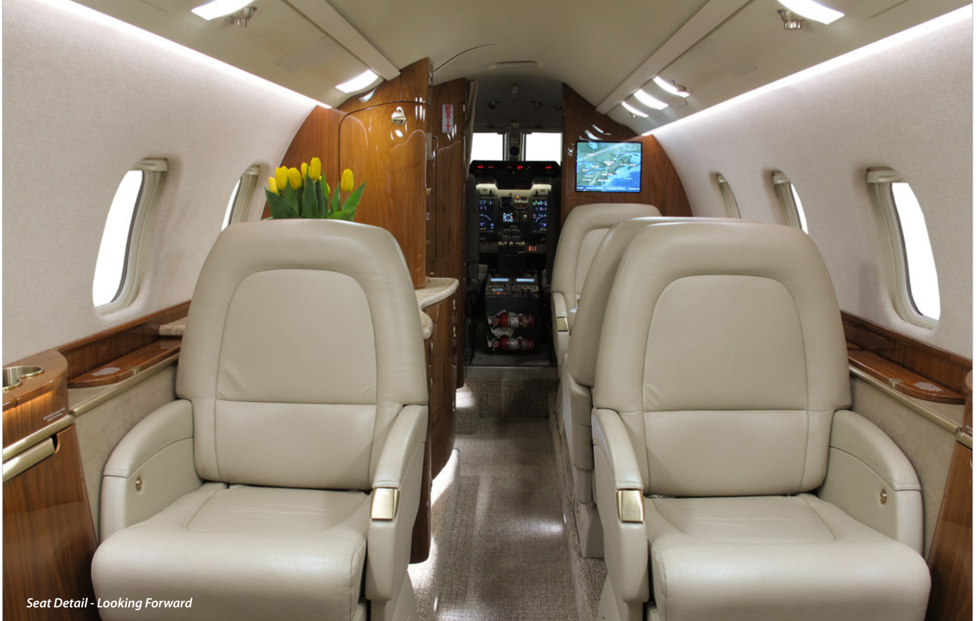
Seat Detail - Looking Forward

Specifications are subject to verification by purchaser. Aircraft is subject to prior sale, and/or removal from the market without prior notice.