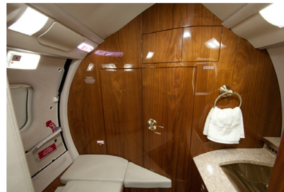
Aft Baggage (Closed)

Specifications are subject to verification by purchaser. Aircraft is subject to prior sale, and/or removal from the market without prior notice.