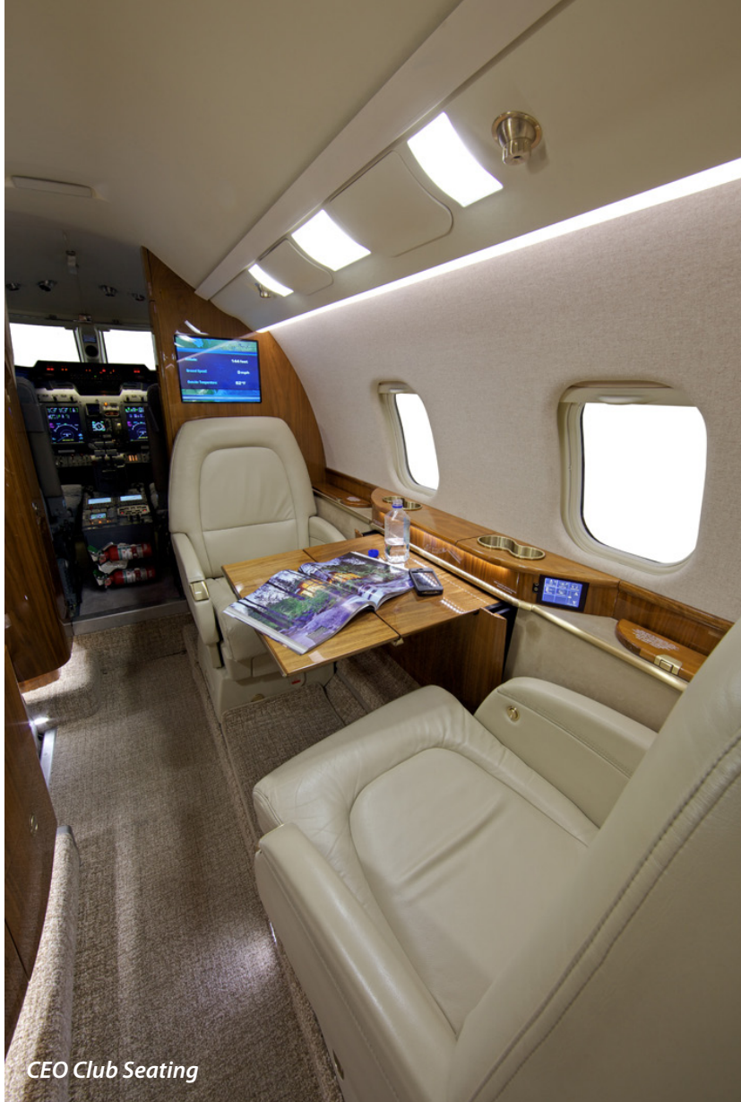
CEO Club Seating