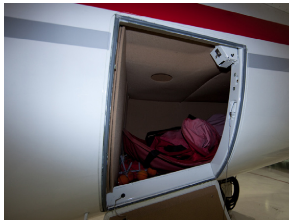
Aft Exterior Baggage