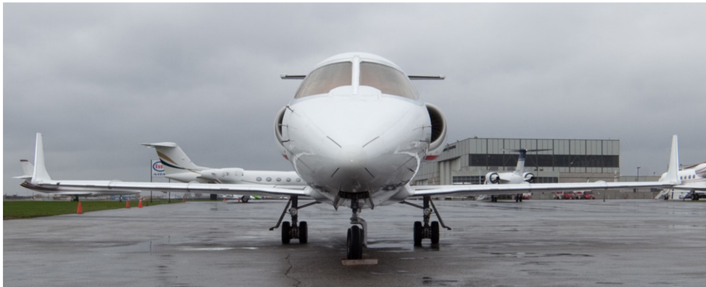
Exterior Profile & Nose

Specifications are subject to verification by purchaser. Aircraft is subject to prior sale, and/or removal from the market without prior notice.