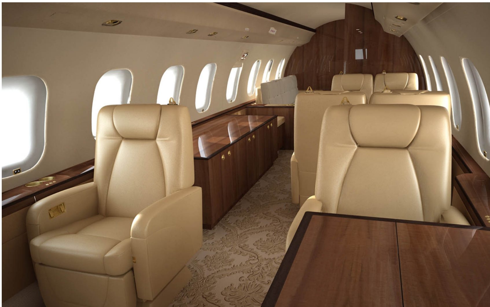
Forward Cabin Facing Aft

Specifications are subject to verification by purchaser. Aircraft is subject to prior sale, and/or removal from the market without prior notice.