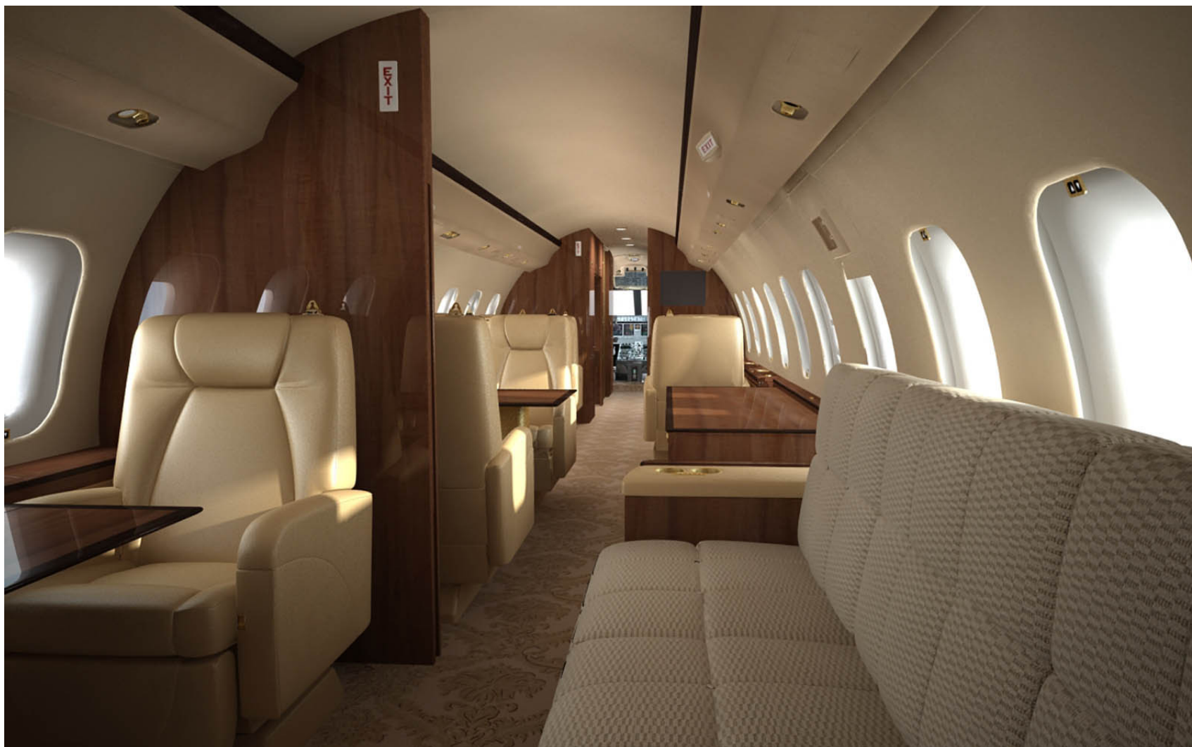
Aft Cabin Facing Forward

Specifications are subject to verification by purchaser. Aircraft is subject to prior sale, and/or removal from the market without prior notice.