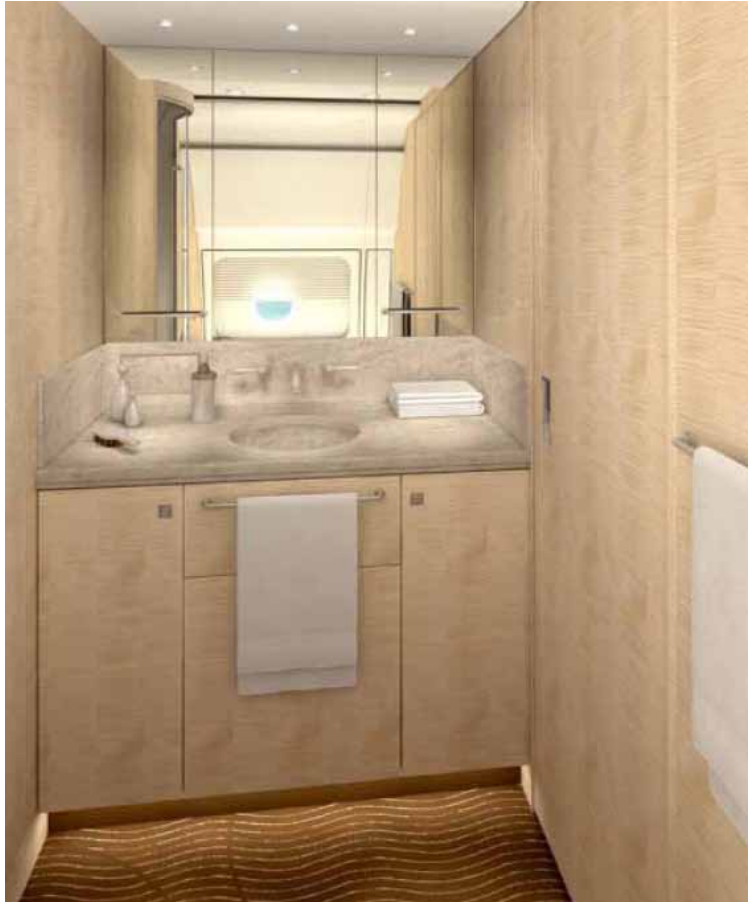
Sample Interior Renderings