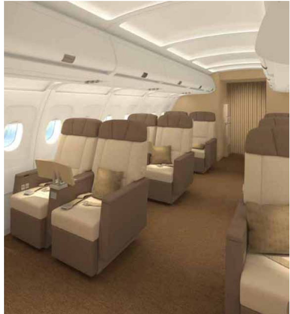
Sample Interior Renderings

Specifications are subject to verification by purchaser. Aircraft is subject to prior sale, and/or removal from the market without prior notice.