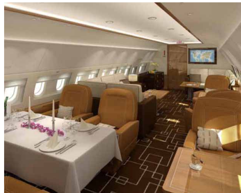
Sample Interior Renderings

Specifications are subject to verification by purchaser. Aircraft is subject to prior sale, and/or removal from the market without prior notice.