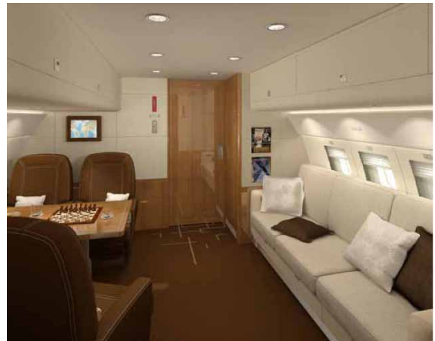
Sample Interior Renderings

Specifications are subject to verification by purchaser. Aircraft is subject to prior sale, and/or removal from the market without prior notice.