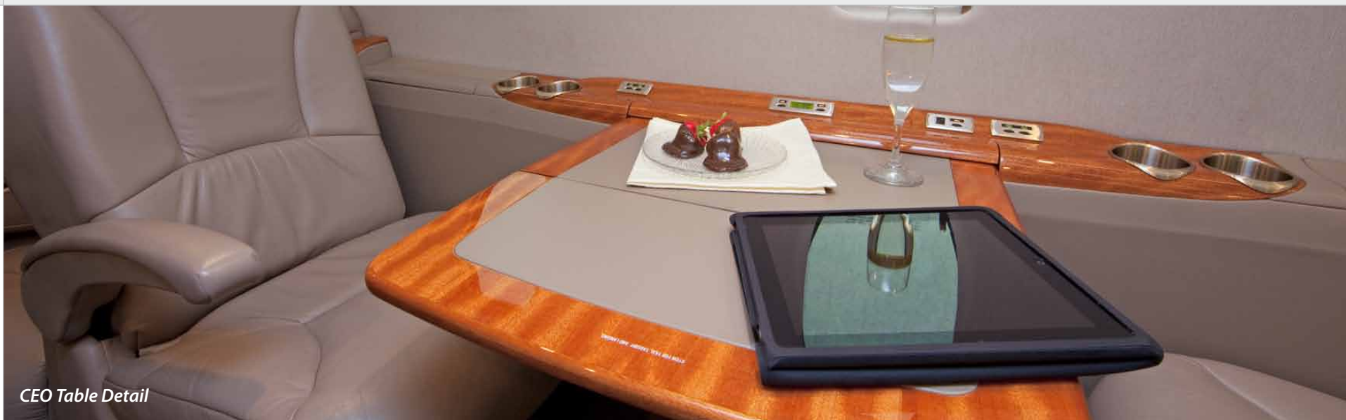
CEO Table Detail