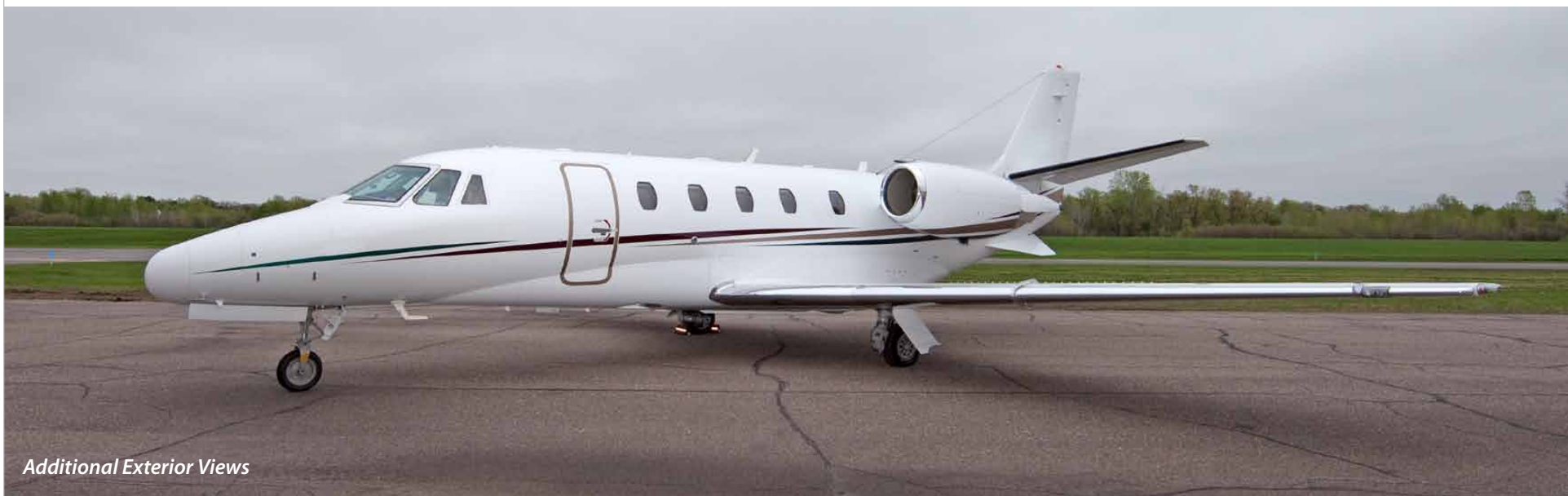
Additional Exterior Views

Specifications are subject to verification by purchaser. Aircraft is subject to prior sale, and/or removal from the market without prior notice.