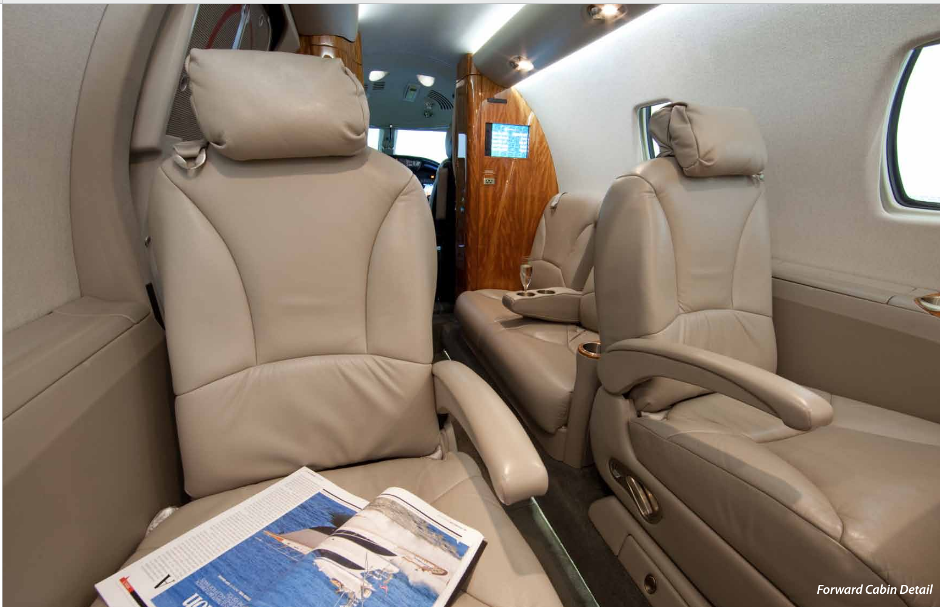
Forward Cabin Detail

Specifications are subject to verification by purchaser. Aircraft is subject to prior sale, and/or removal from the market without prior notice.