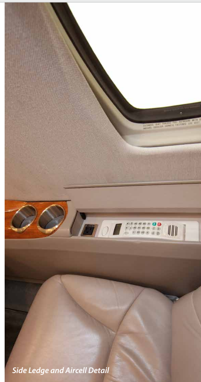
Side Ledge and Aircell Detail

Specifications are subject to verification by purchaser. Aircraft is subject to prior sale, and/or removal from the market without prior notice.