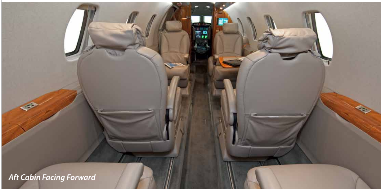
Aft Cabin Facing Forward