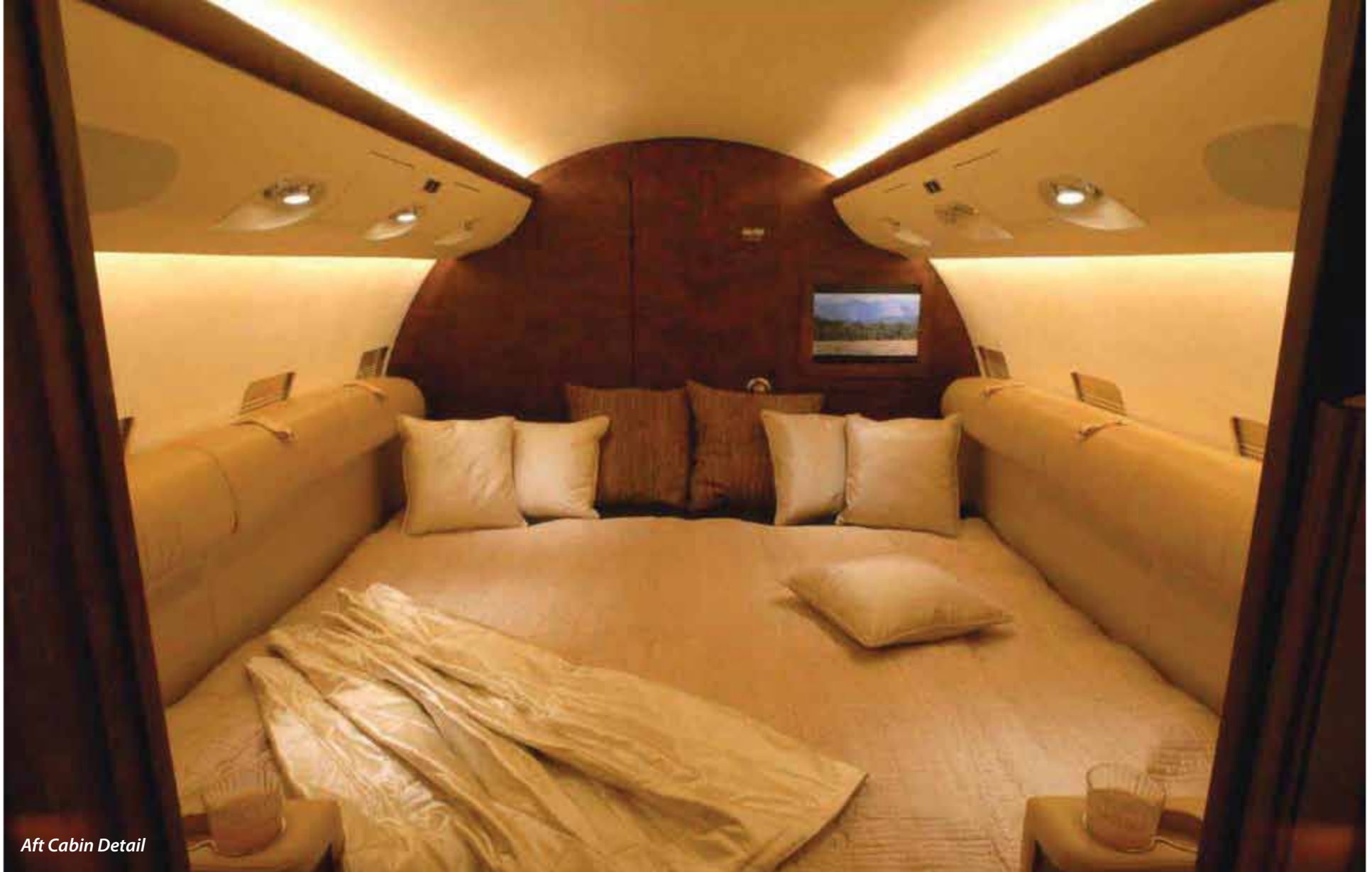
Aft Cabin Detail

Specifications are subject to verification by purchaser. Aircraft is subject to prior sale, and/or removal from the market without prior notice.