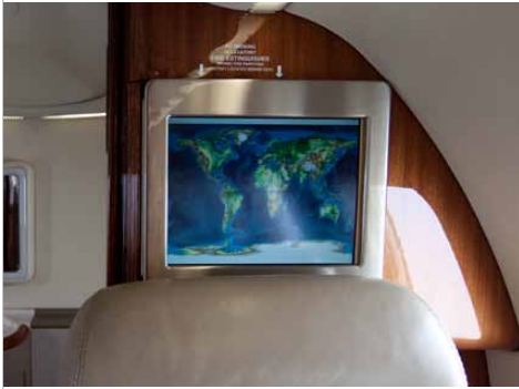
Cabin Airshow Stowed