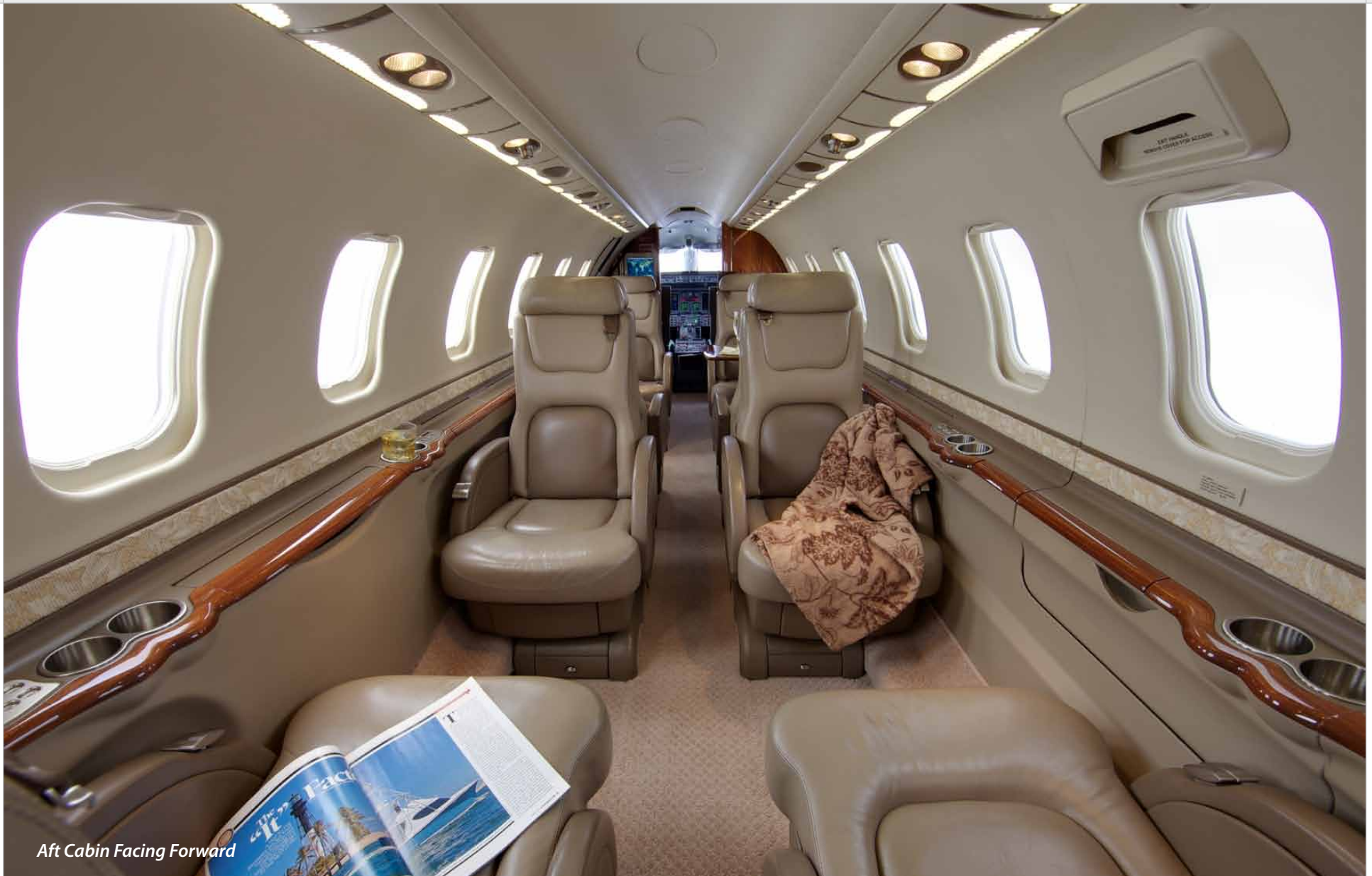
Aft Cabin Facing Forward

Specifications are subject to verification by purchaser. Aircraft is subject to prior sale, and/or removal from the market without prior notice.