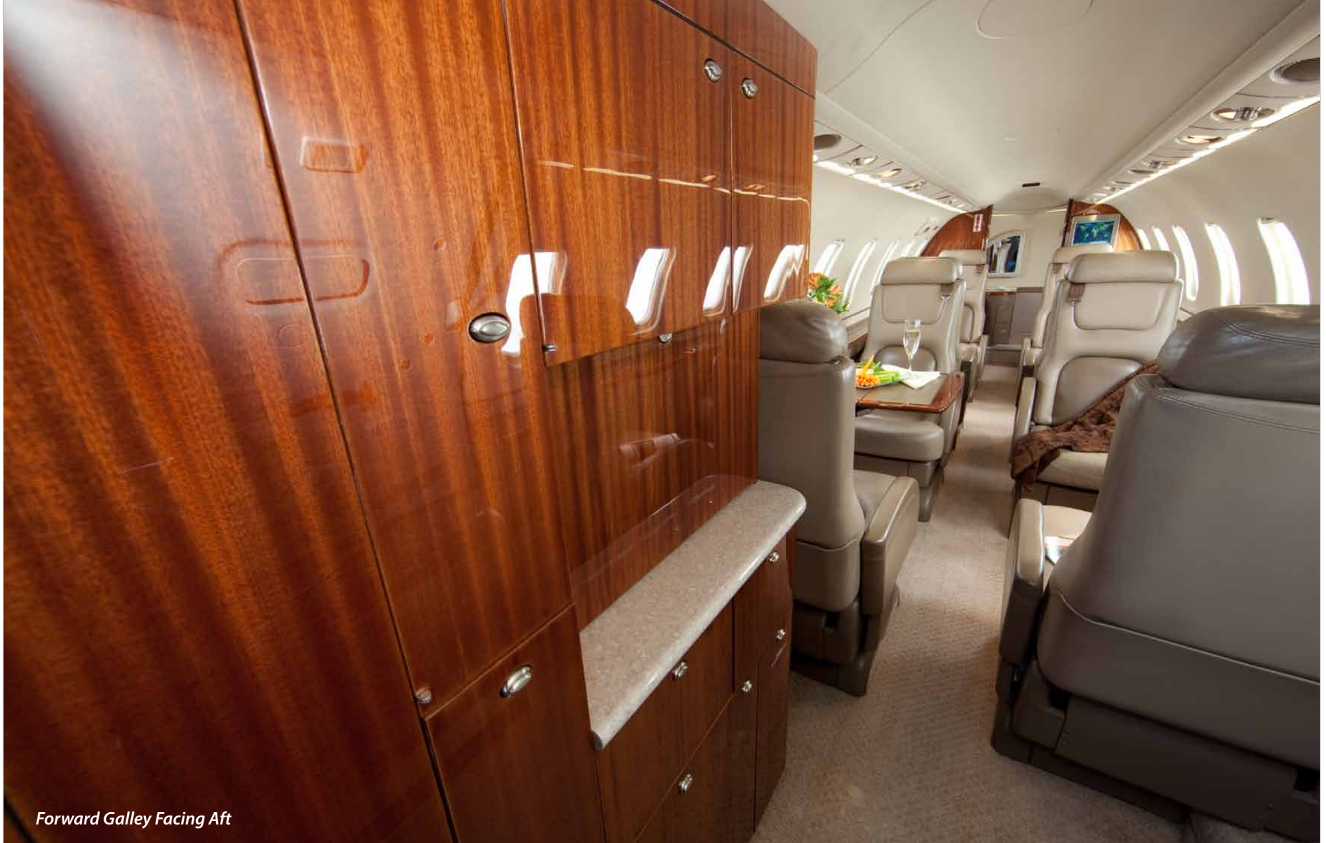
Forward Galley Facing Aft

Specifications are subject to verification by purchaser. Aircraft is subject to prior sale, and/or removal from the market without prior notice.