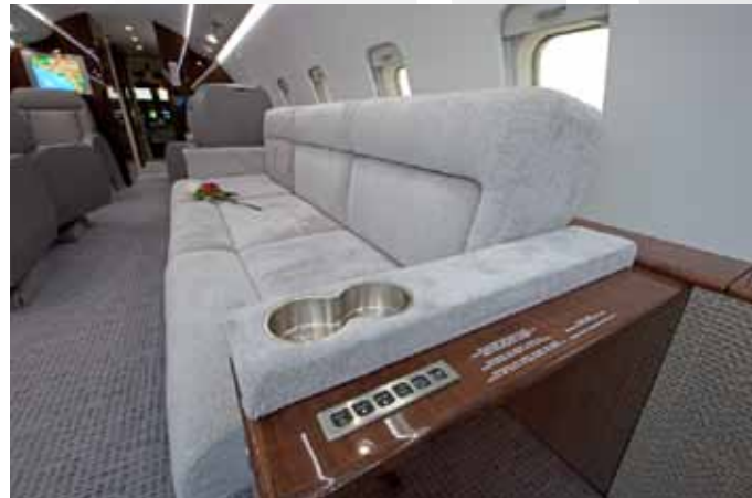
Mid-Cabin Divan Detail

Specifications and/or descriptions are provided as introductory information only and do not constitute representations or warranties. Verification of specifications remain the sole responsibility of purchaser. Aircraft is subject to prior sale, lease, and/or removal from the market without prior notice.