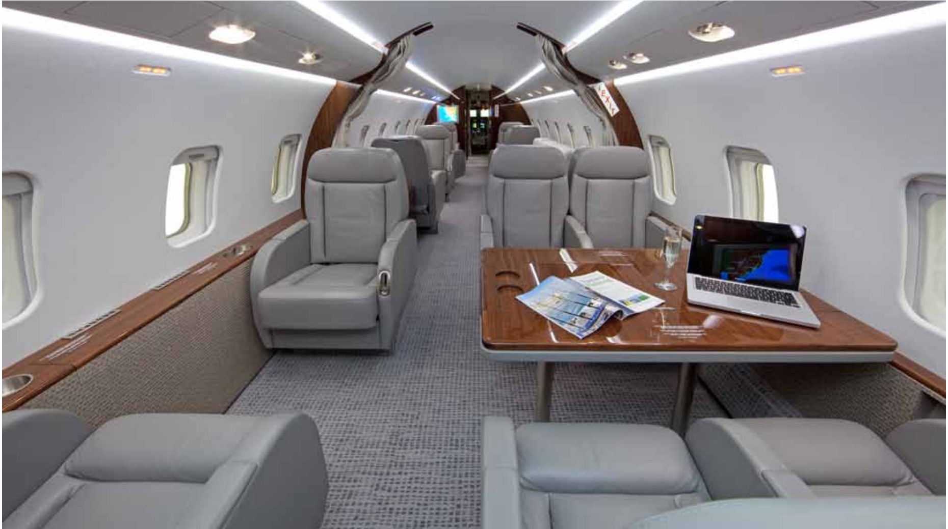
Aft Cabin Facing Forward

Specifications and/or descriptions are provided as introductory information only and do not constitute representations or warranties. Verification of specifications remain the sole responsibility of purchaser. Aircraft is subject to prior sale, lease, and/or removal from the market without prior notice.