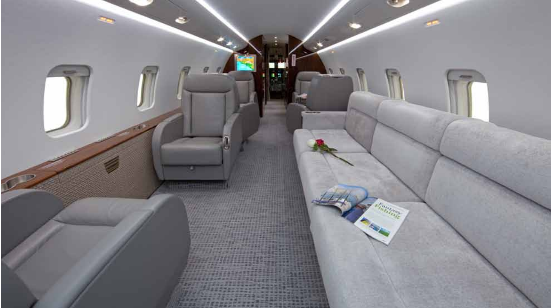
Forward Cabin Facing Aft

Specifications and/or descriptions are provided as introductory information only and do not constitute representations or warranties. Verification of specifications remain the sole responsibility of purchaser. Aircraft is subject to prior sale, lease, and/or removal from the market without prior notice.