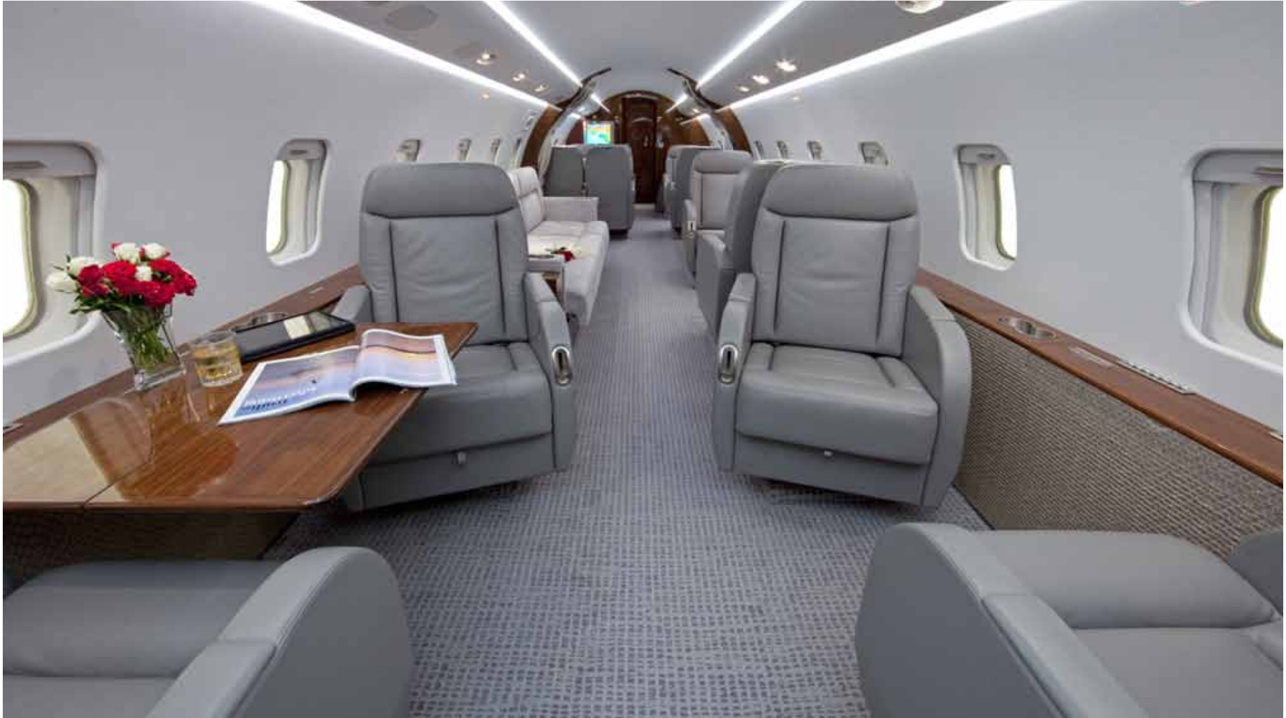
Forward Cabin Facing Aft

Specifications and/or descriptions are provided as introductory information only and do not constitute representations or warranties. Verification of specifications remain the sole responsibility of purchaser. Aircraft is subject to prior sale, lease, and/or removal from the market without prior notice.