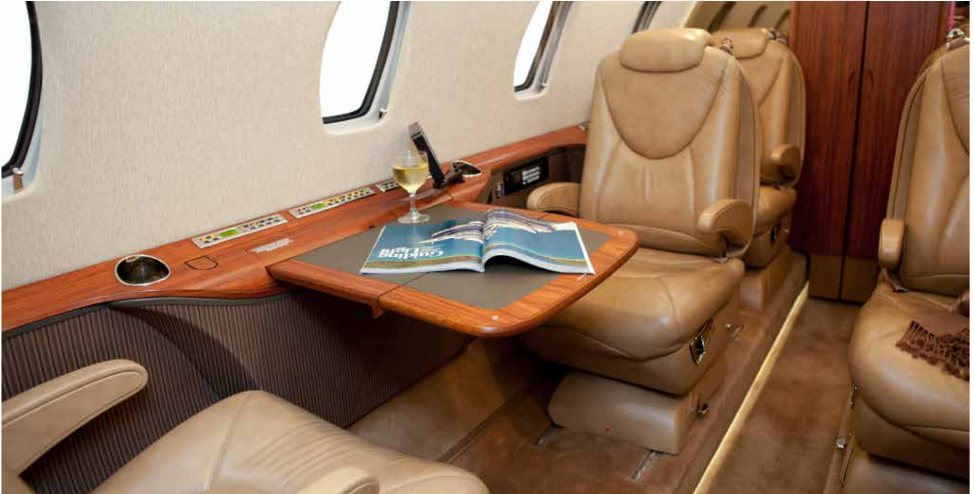
Forward Club Seating

Specifications and/or descriptions are provided as introductory information only and do not constitute representations or warranties. Verification of specifications remain the sole responsibility of purchaser. Aircraft is subject to prior sale, lease, and/or removal from the market without prior notice.