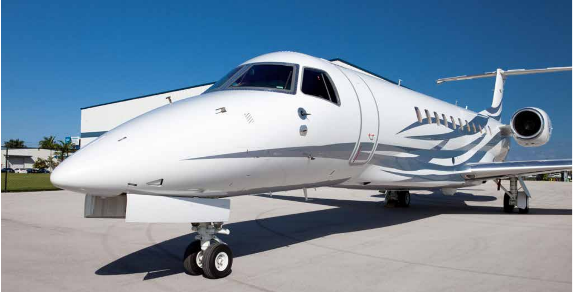
Exterior Nose Detail

Specifications and/or descriptions are provided as introductory information only and do not constitute representations or warranties. Verification of specifications remain the sole responsibility of purchaser. Aircraft is subject to prior sale, lease, and/or removal from the market without prior notice.