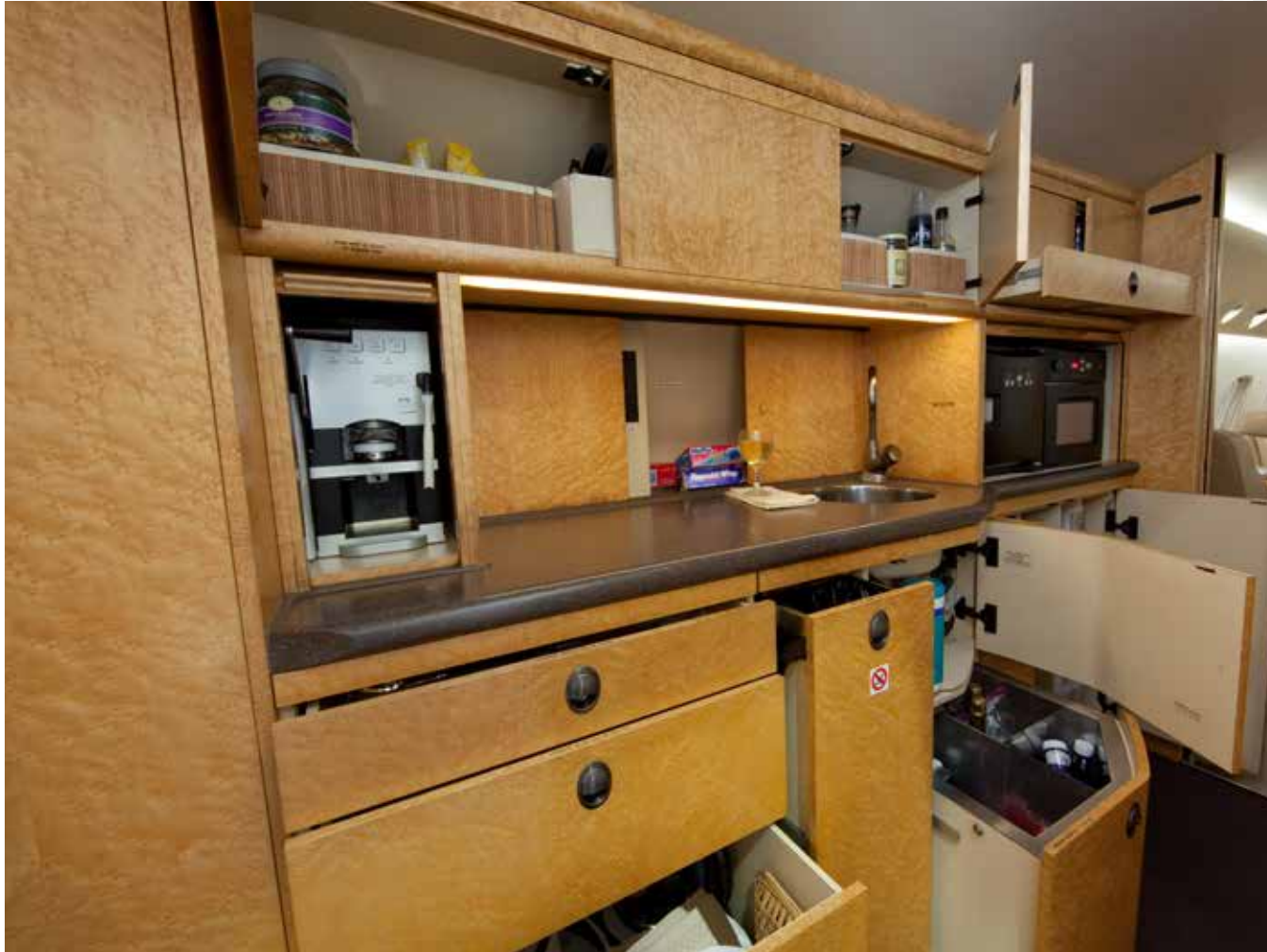
Forward Galley (Open)