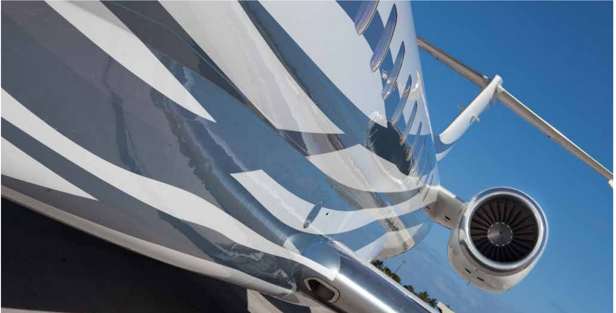
Exterior Paint Detail

Specifications and/or descriptions are provided as introductory information only and do not constitute representations or warranties. Verification of specifications remain the sole responsibility of purchaser. Aircraft is subject to prior sale, lease, and/or removal from the market without prior notice.