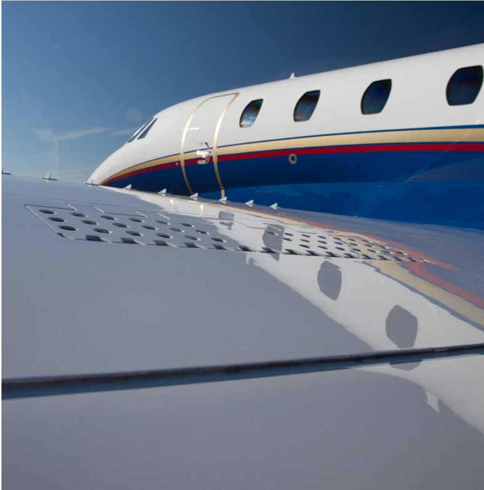
Exterior Left Wing