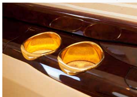
Sidewall Cup Holders