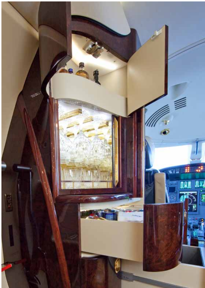
Galley Storage (Open)