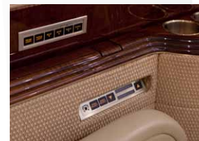
Side Panel Controls