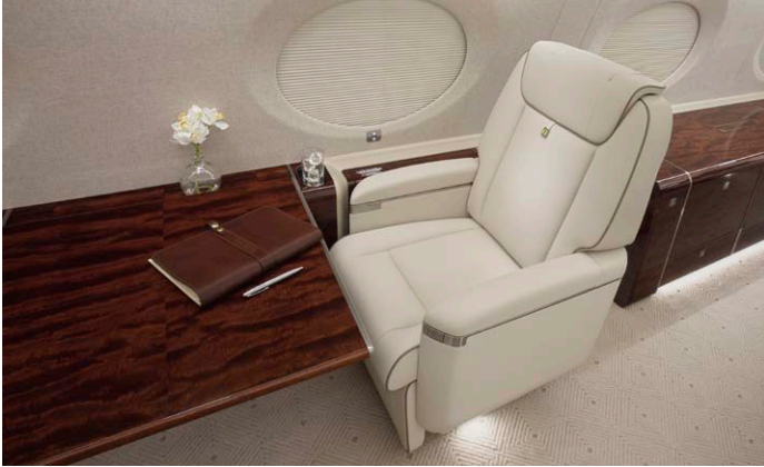
Executive Seating Detail