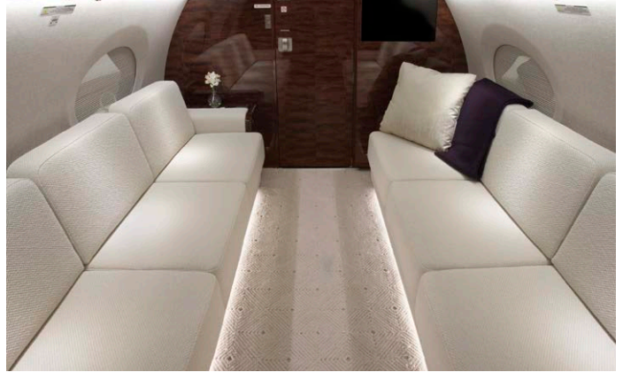
Aft Divan Detail