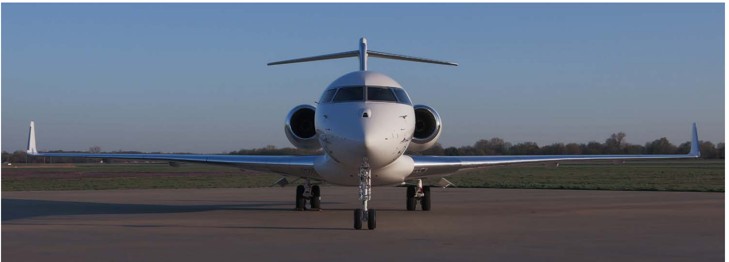
Exterior - Head On View

Specifications and/or descriptions are provided as introductory information only and do not constitute representations or warranties. Verification of specifications remain the sole responsibility of purchaser. Aircraft is subject to prior sale, lease, and/or removal from the market without prior notice.